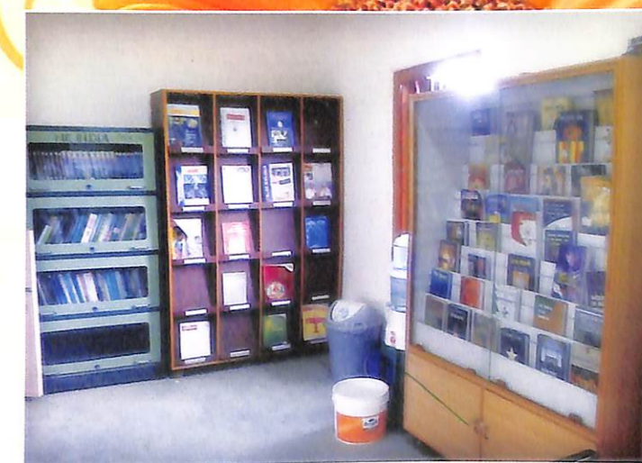
Journal & New Book Storage Cum display rack