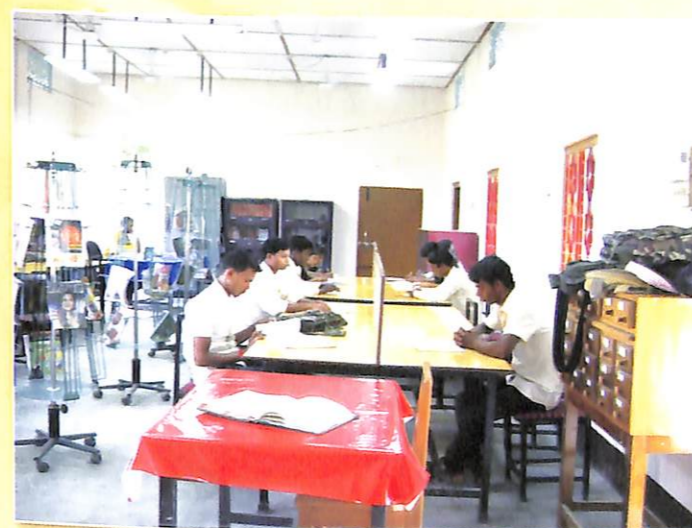
Student Reading Room, Central Library