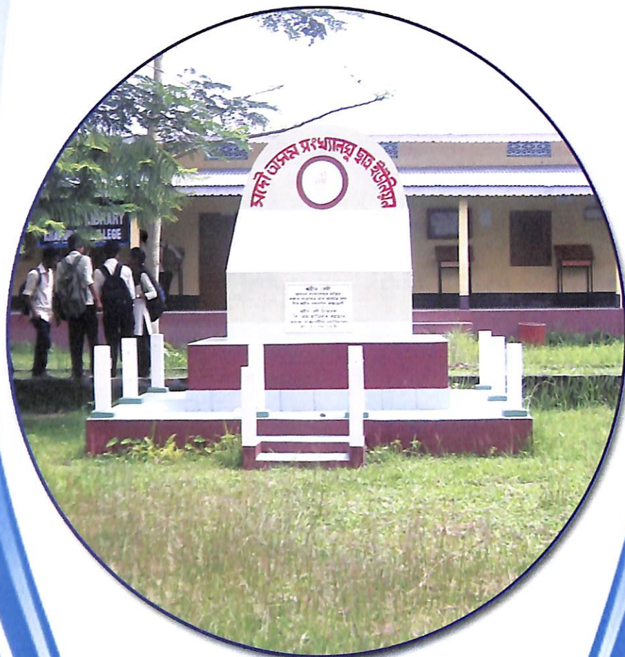
Swahid Bedi Kharupeta College