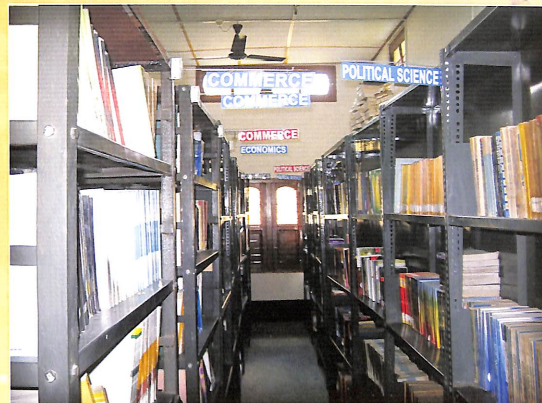
A Portion of Book Storage, Central Library