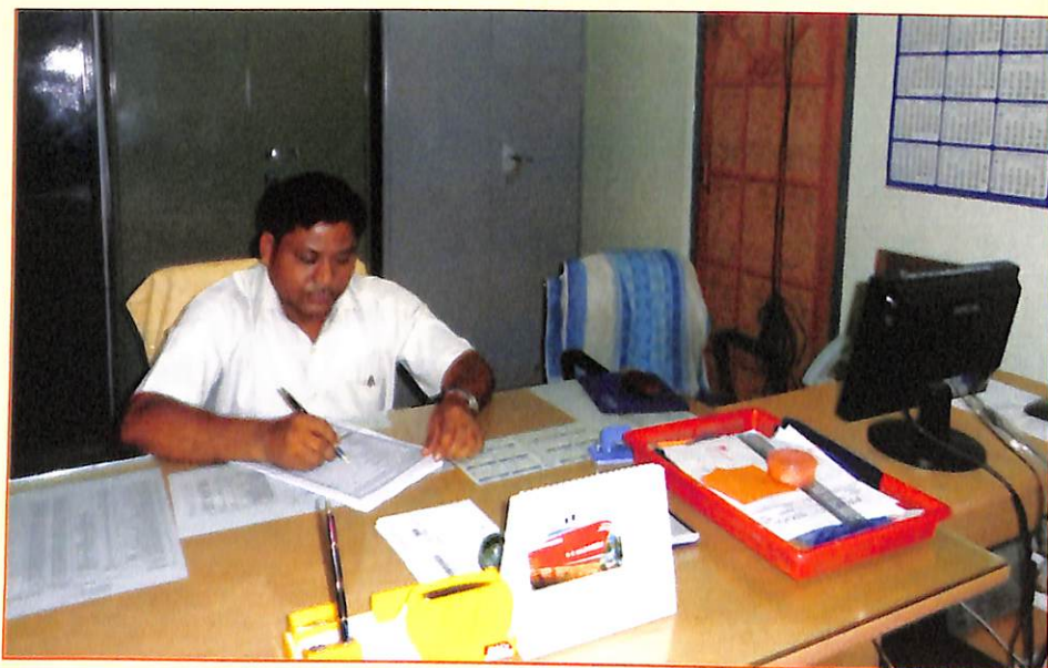
PRINCIPAL OF THE COLLEGE